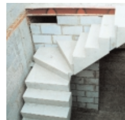
Adjustable support brackets