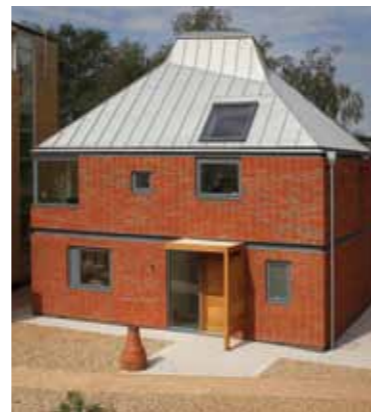
EcoHouse™ – The BRE Innovation Park