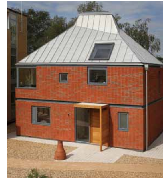
EcoHouse™ – The BRE Innovation Park

Details of this project can be viewed at: www.hanson.com/uk