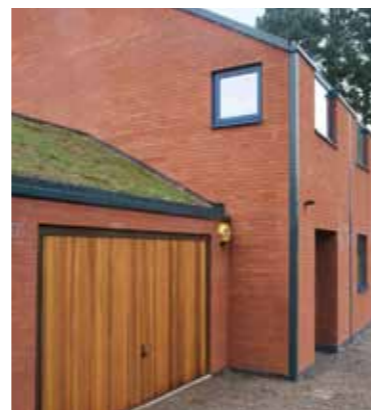
Lawn House – Leicestershire